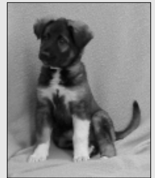
Have a Heart puppy at two months